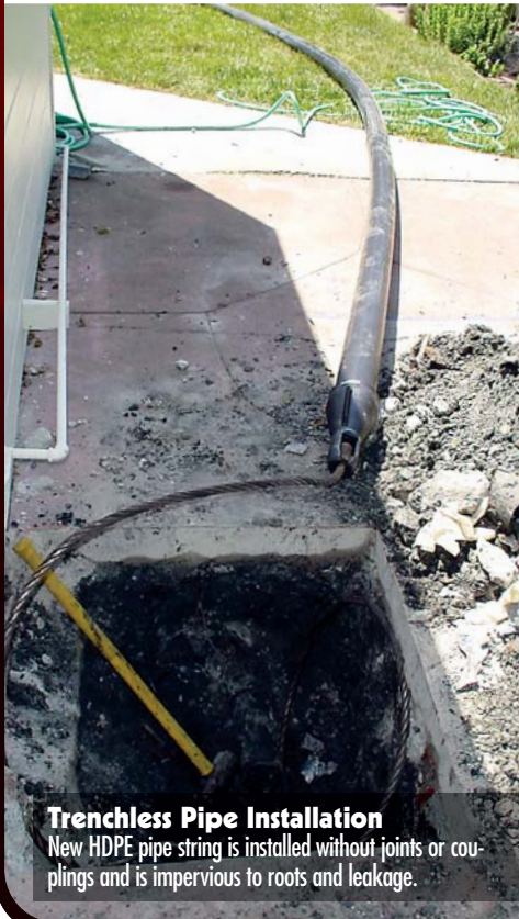
Trenchless Pipe Installation New HDPE pipe string is installed without joints or couplings and is impervious to roots and leakage.

In the field, on the phone or in your office — you can count on Hammerhead to be your trusted partner.