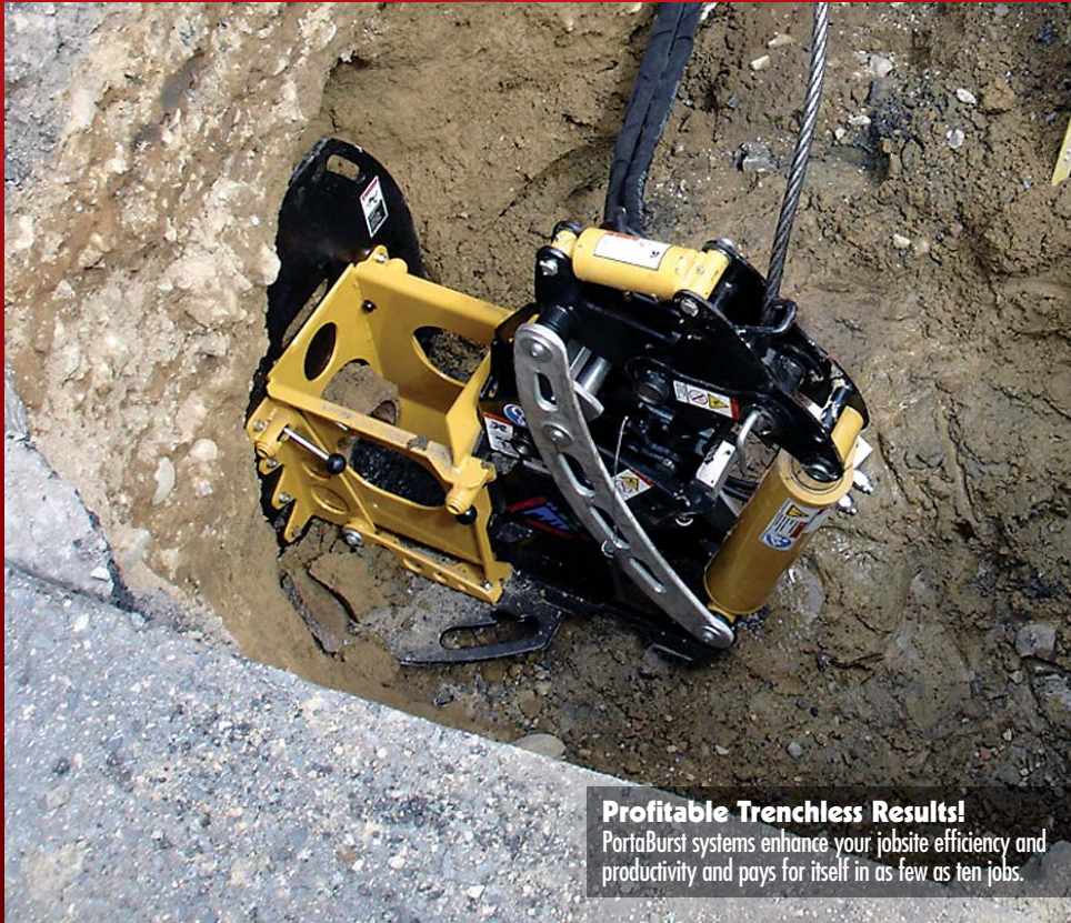
Profitable Trenchless Results! PortaBurst systems enhance your jobsite efficiency and productivity and pays for itself in as few as ten jobs.